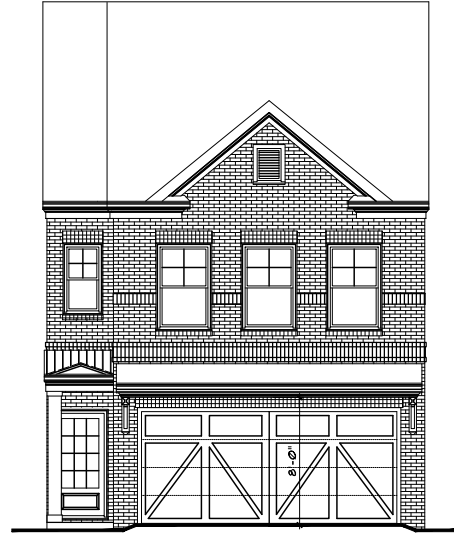
FRONT ELEVATION B