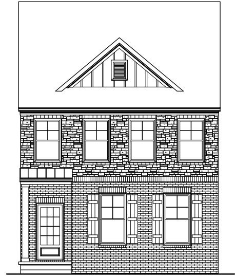
FRONT ELEVATION B