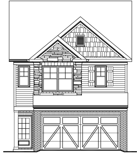
FRONT ELEVATION D