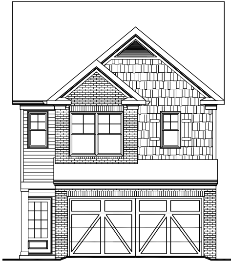
FRONT ELEVATION C