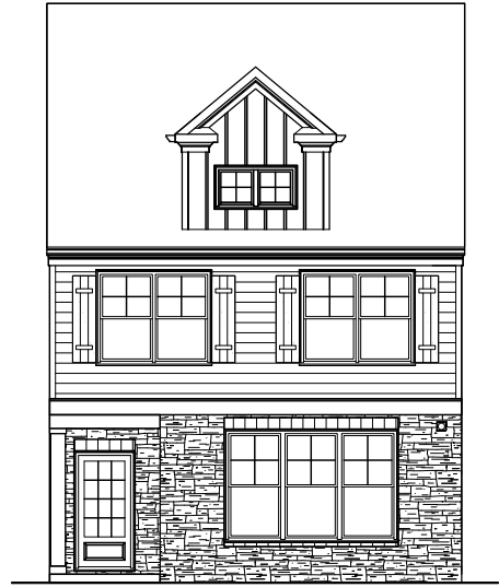
FRONT ELEVATION D