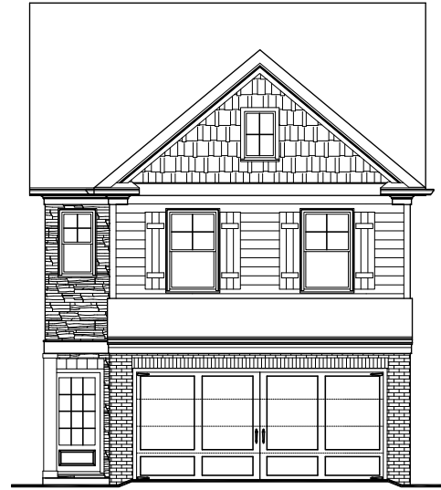
FRONT ELEVATION D