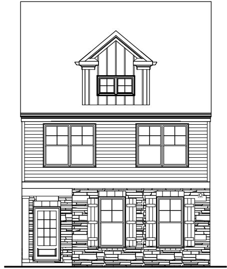
FRONT ELEVATION B